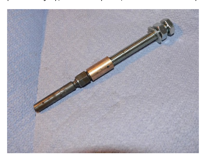
Pressing injector into a seal:

The following picture shows a tool loaded with an injector ready for installation. Just screw the tool on the injector finger tight, lubricate the injector's body with a little engine oil, petroleum jelly, or assembly lube, then use the tool to press the injector into the seal.